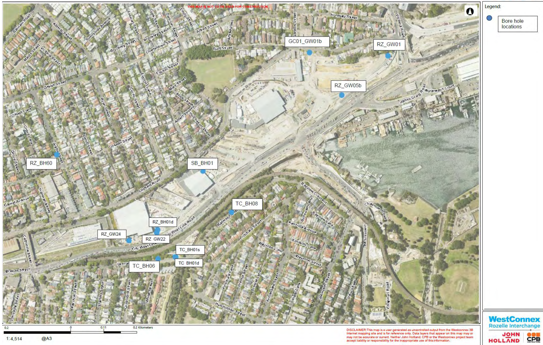
Figure 3 Construction phase groundwater monitoring network – salinity logger locations (Rozelle)