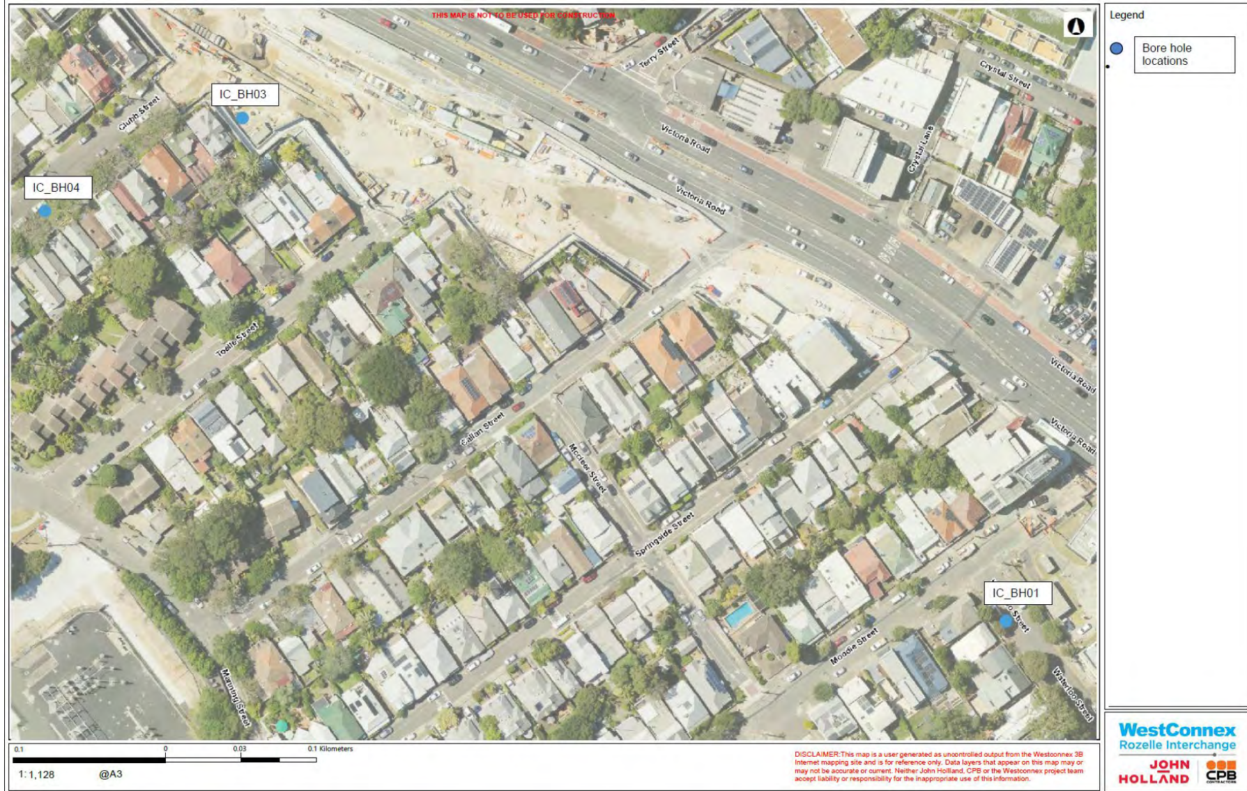
Figure 4 Construction phase groundwater monitoring network – salinity logger locations (Iron Cove)