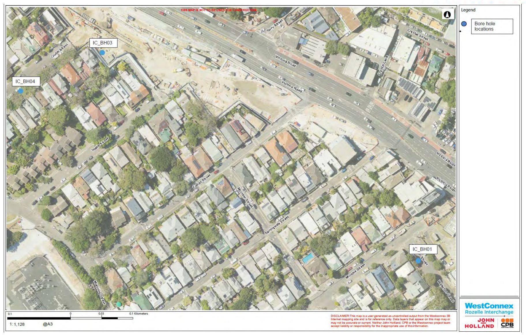
Figure 4 Construction phase groundwater monitoring network – salinity logger locations (Iron Cove)