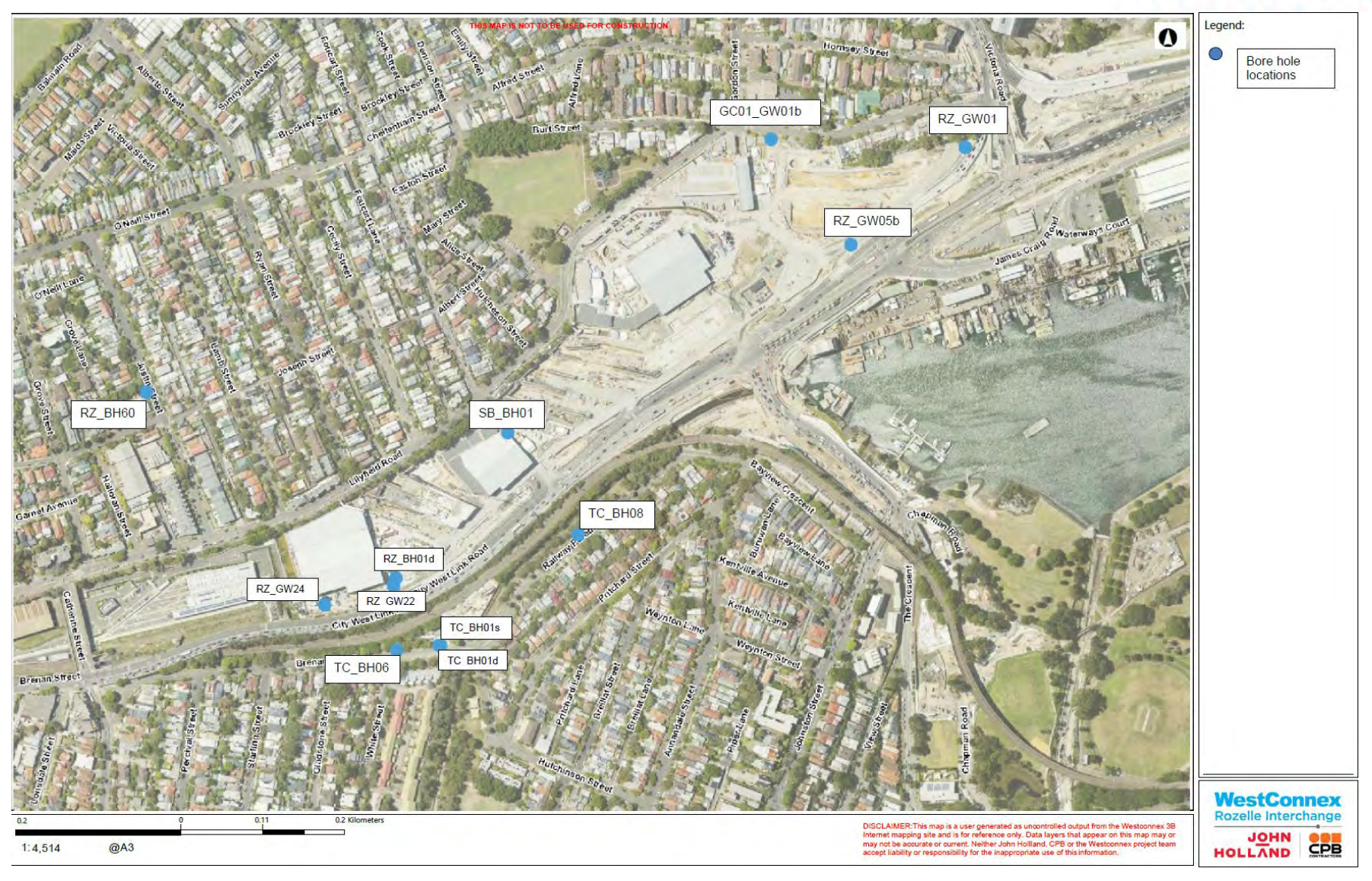
Figure 3 Construction phase groundwater monitoring network – salinity logger locations (Rozelle)