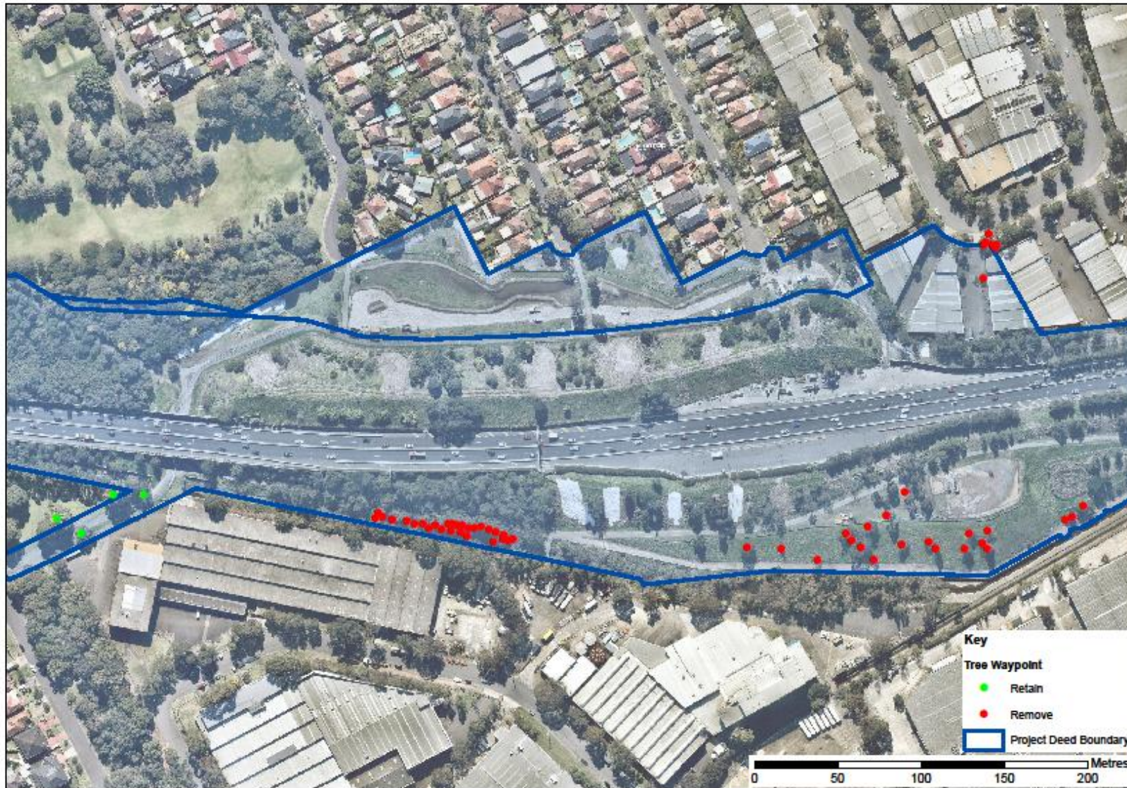
Map 3. Location of trees to be removed red dot. Green dot trees retention/ or removal of trees under consideration.