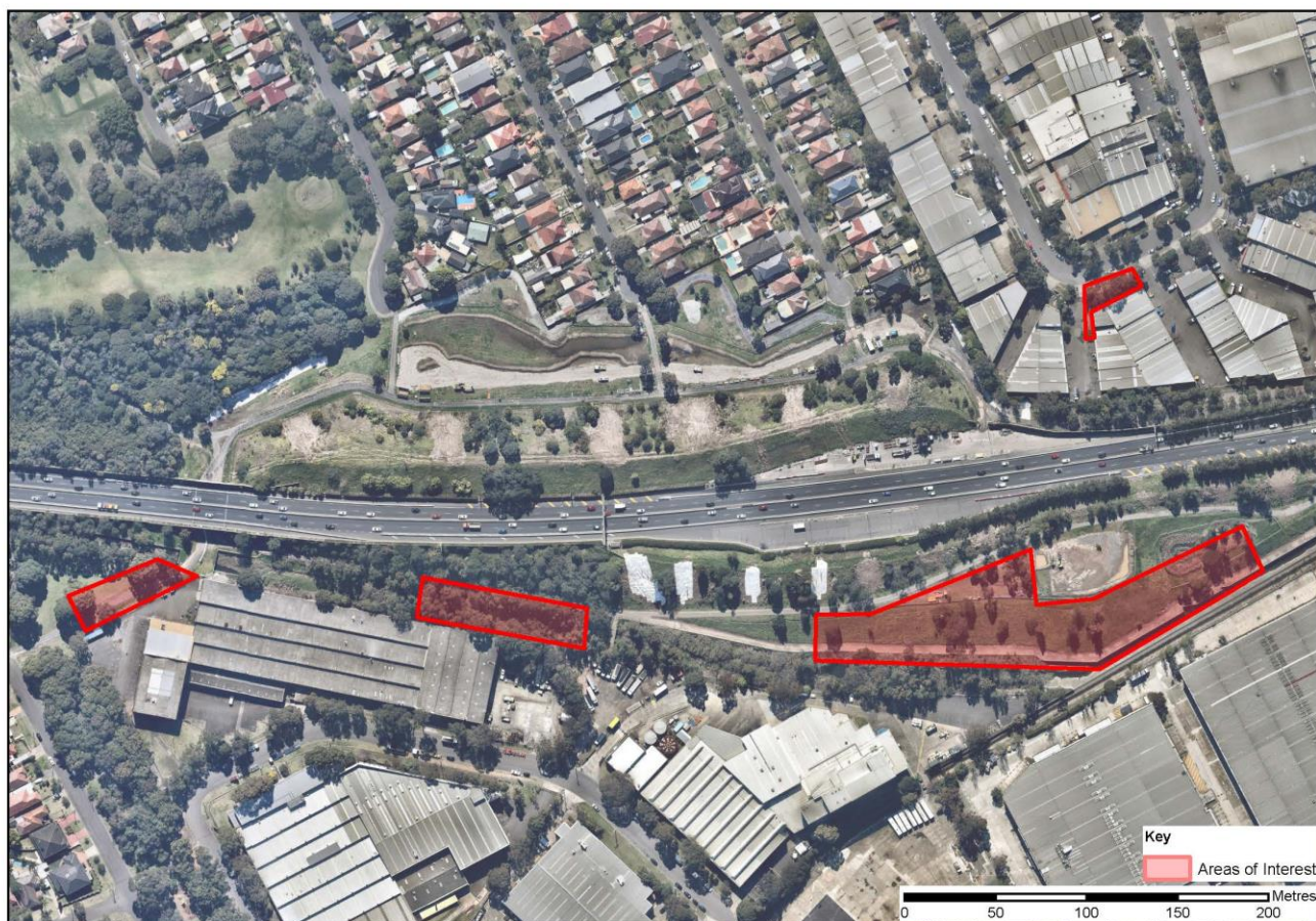
Map 1. The four (4) sites of interest.

Future works that may affect trees beyond the study area will be addressed in a tree report prepared and approved before any such works.