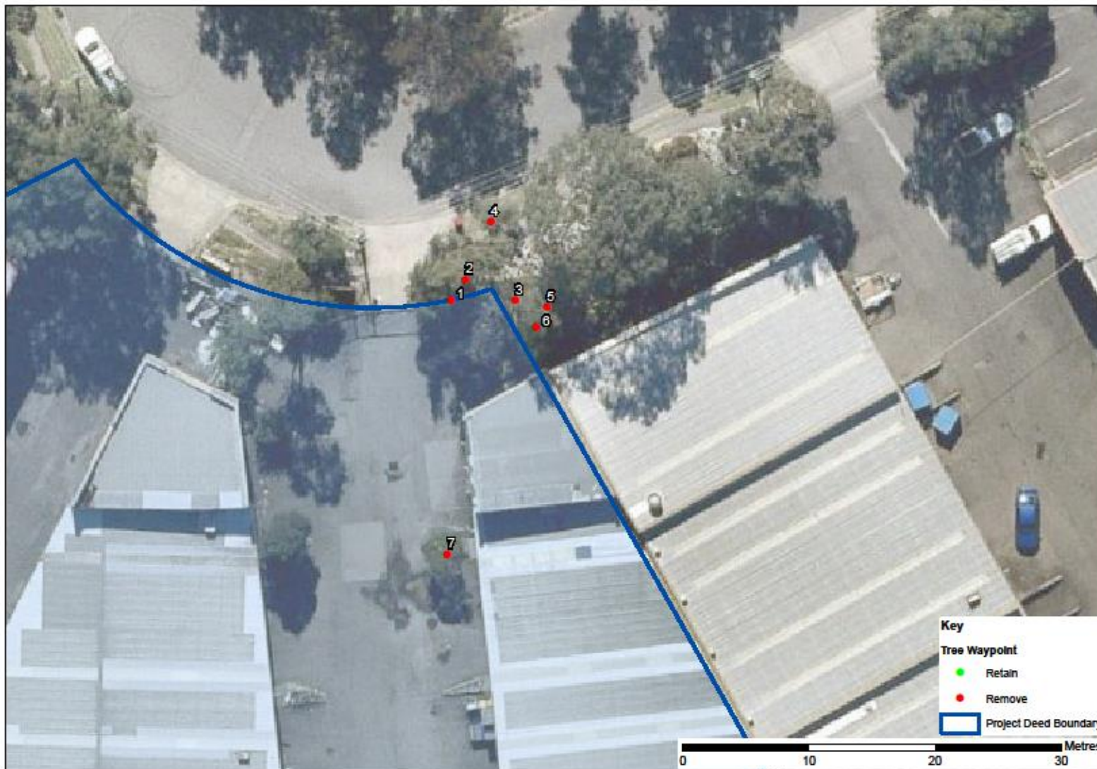
Map 4. Trees proposed for removal from tunnelling site.