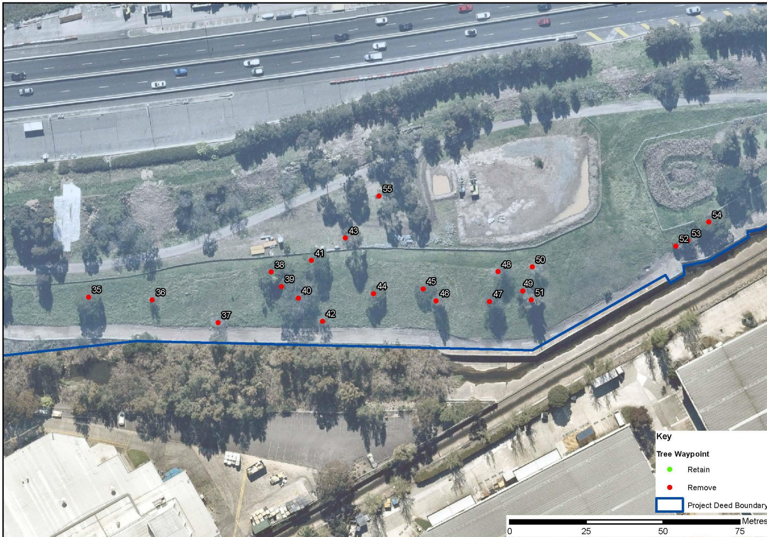
Map 6. Trees to be removed from Motorway complex.