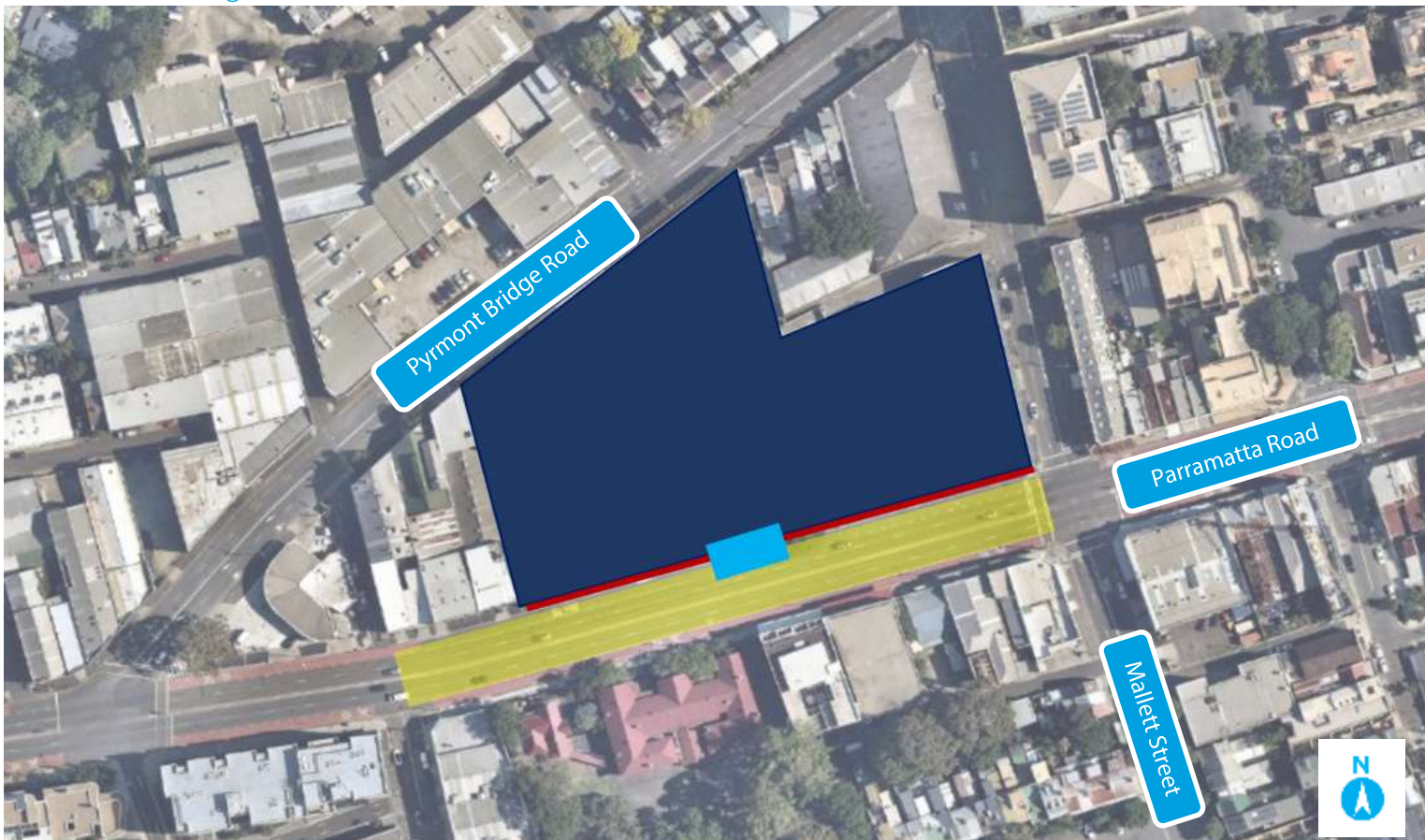
Map image Google 2019